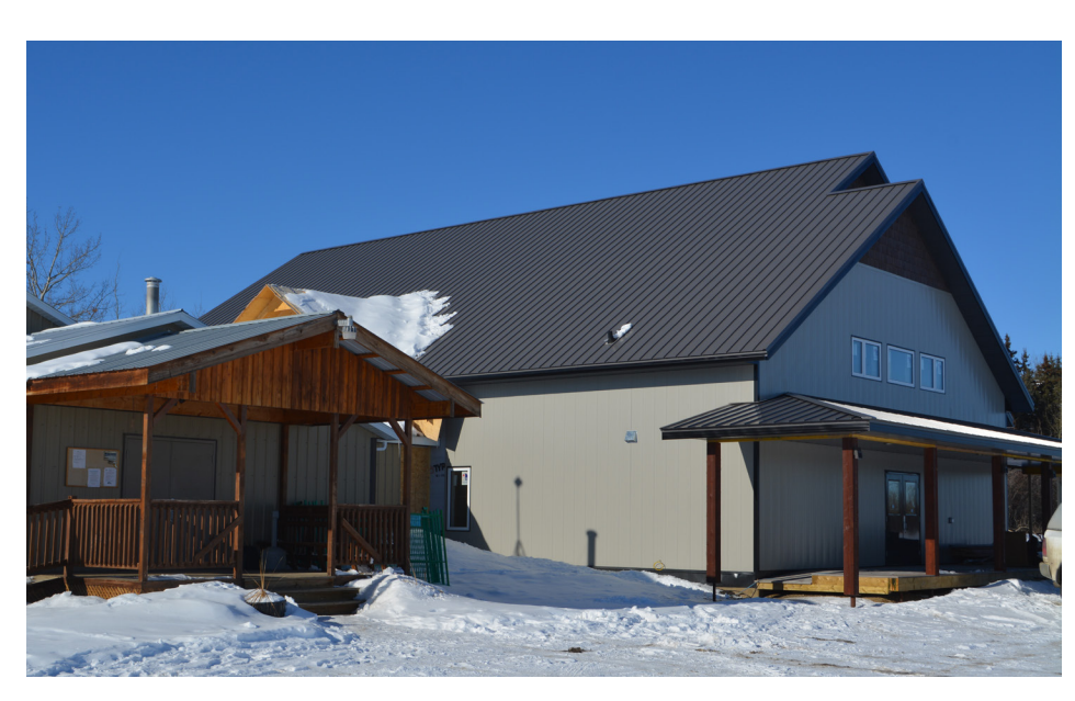
New Fourth Creek Hall under construction