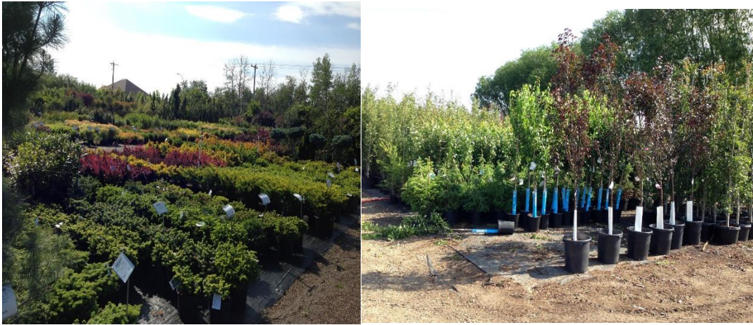
Picture 1. Variety of sizes for potted trees and shrubs

problems in the future health of your trees. If you see the roots are excessively bound or the trees are damaged - simply don't buy it.