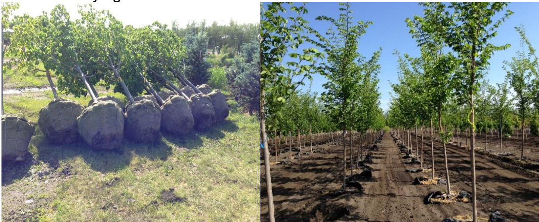
Picture 2. Burlap and Basket (B&B) tree requires additional equipment and care for transportation or planting.