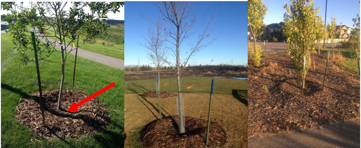
Picture 5. Create donut not volcano shape around trees with mulch. The arrow shows proper tree planting depth. Every tree has point where the trunk and roots join - it is called root collar. This root collar has to be visible after tree planting.