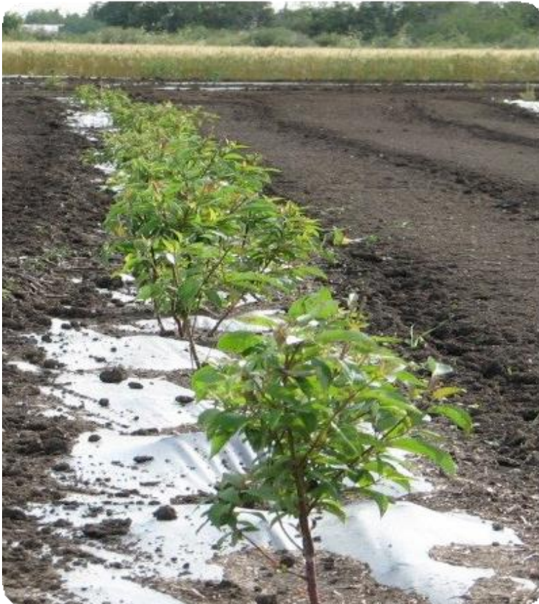
Picture: Properly planted and weed controlled shelterbelt