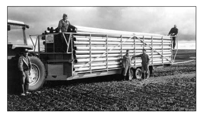
Figure 2. Water pumping program

Truck in water or pump from another water source.