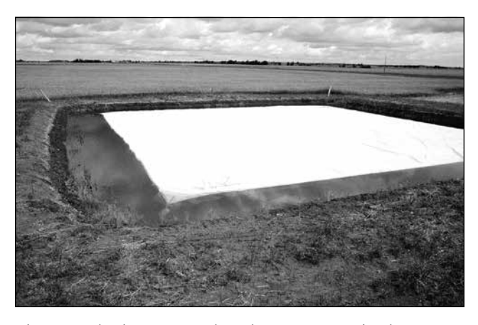
Figure 4. Plastic cover to reduce dugout evaporation losses