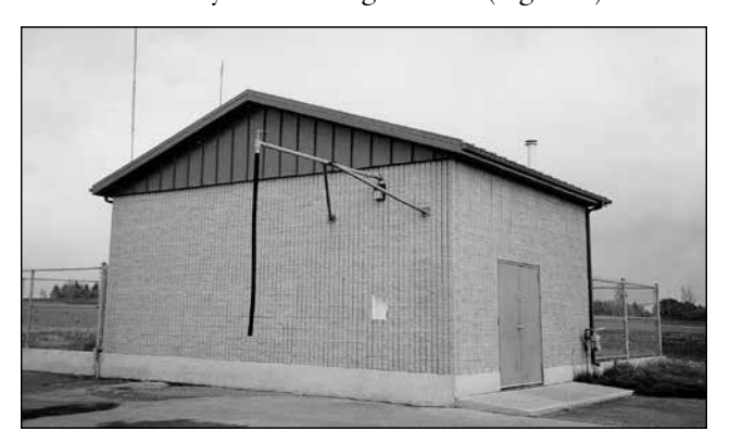
Figure 5. Tank loading facilities