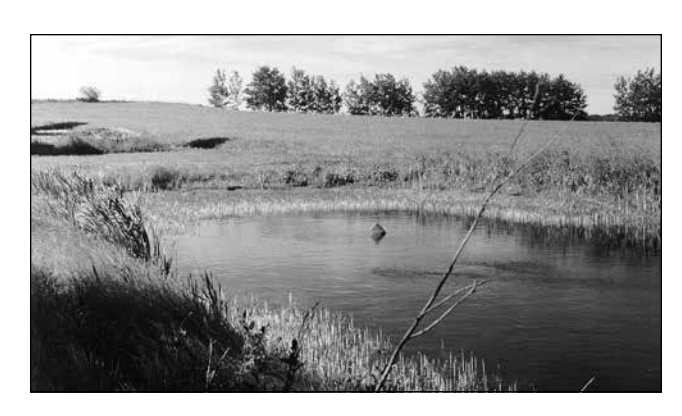
Figure 1. Water is essential

Water is essential to all human activity (Figure 1). The way water resources are managed will determine the future of the prairie economy. Security of water supply has been a primary goal of Canada/Alberta cost-share programs since the drought in 2000. The latest program is called Growing