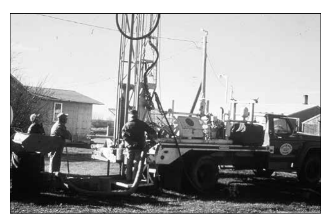
Figure 6. Test drilling to locate groundwater aquifers

In many areas, municipalities have also been involved in groundwater test drilling programs to locate significant groundwater aquifers in water shortage areas (Figure 6). These higher producing aquifers can become excellent locations for tank loading facilities or regional pipelines.