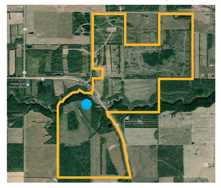
Blue dot shows the location of the new ACA fish pond.

In 2011, the Alberta Conservation Association (ACA) acquired the big parcel of land (now known as the Shell True North Forest conservation site) with financial support from Shell plus hunters and anglers of the Province.