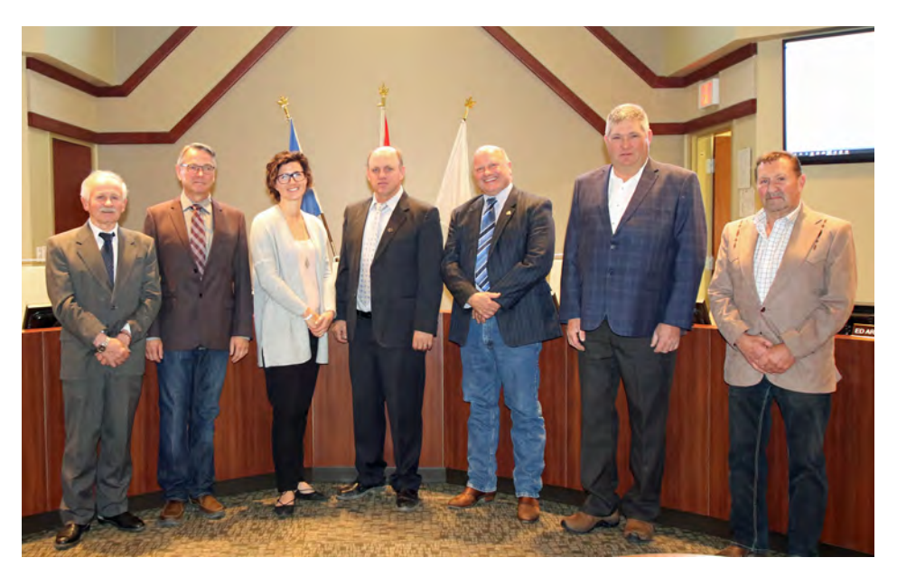
Saddle Hills County Council set out a series of strategic goals and objectives in its 2018–2020 Strategic Plan.

The Plan was distributed throughout the County, published on the County website and is available by request through the County office.