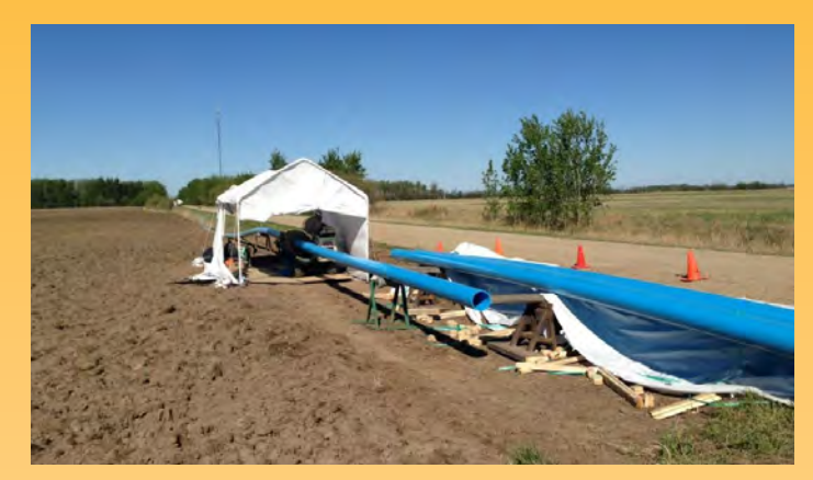
Residents will see much the same above-ground activity as they did during the installation of the pipeline from the Bonanza water treatment plant into the center of Bonanza.