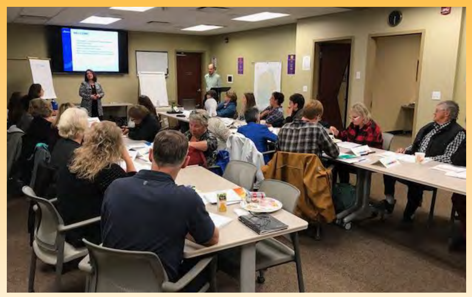
The Non-Profit Development Workshops for local community groups were well attended.

The sessions were intended for non-profit organizations and community leaders on a variety of governance and fundraising issues facing non-profits.